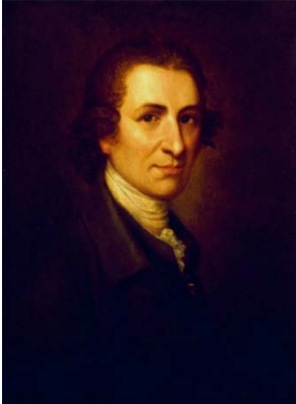
Thomas Paine by Matthew Pratt 1785-95

No one could have predicted the profound impact that a 47-page pamphlet would have on the turmoil brewing in the American Colonies in the 1770's. Yet, in January 1776, Thomas Paine published Common Sense , a work that would rally a people and inspire the declaration of a new nation.