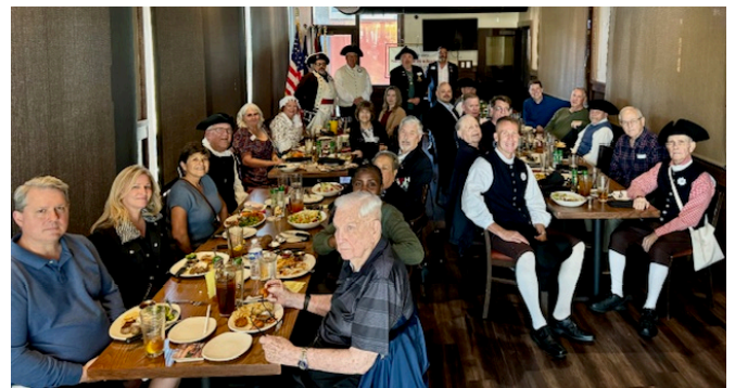
November 23, 2024, Fort Lauderdale SAR Lunch Group

To read the complete set of the minutes of the general members meeting held on November 23, 2024, open the document sent to you by e-mail, or review it at the archive's subpage for minutes and agendas which are maintained at the Chapter website: www.fortlauderdale.sar.org .