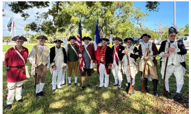
FLSSAR Sons of Liberty Color Guard Brigade – November 11, 2024